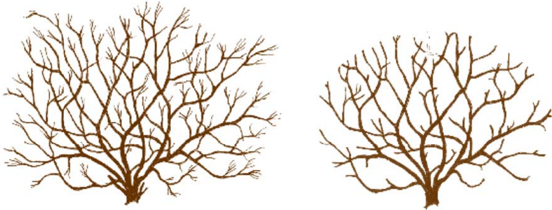
A CHINA ROSE — TWIGGY AND BUSHY(L) BEFORE PRUNING and (R) AFTER PRUNING

Remove any dead growth, but the China Rose is naturally “twiggy,” and should remain so. Remove as much of the FOLIAGE as possible. If you miss a few leaves, a good dormant spray should get rid of them. Rake up and dispose of all fallen leaves and dead plant material. BE GENTLE!