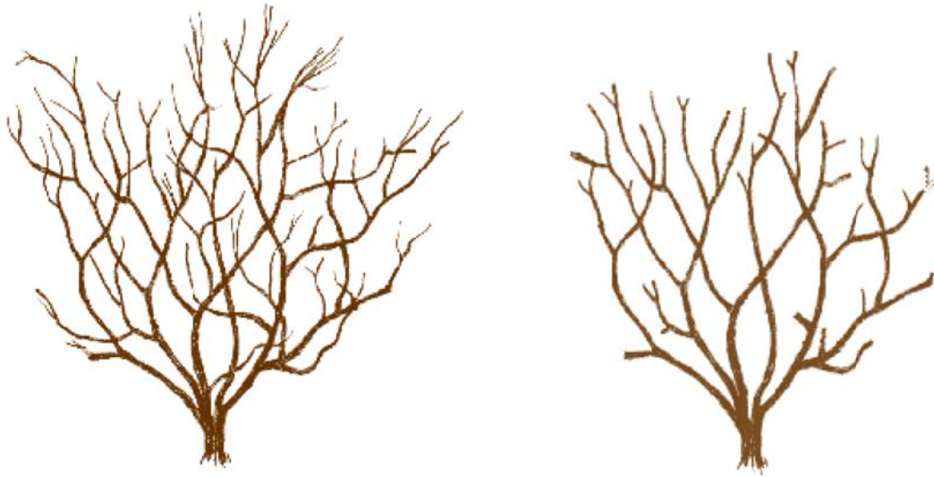
ELEGANT TEA ROSES(L) BEFORE PRUNING and (R) AFTER PRUNING

Remove any dead growth, and as much of the FOLIAGE as possible. Open the center of the plant up, and remove the worst of the crossing growth, but leave the main canes untouched where it is possible to do so. If you miss a few leaves, they will probably fall away shortly after dormant spraying is done. Rake up and dispose of all fallen leaves and dead plant material.